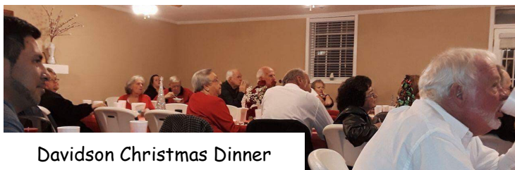
Davidson Christmas Dinner