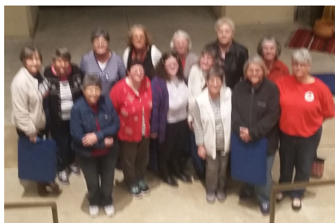
At Right: Lakeview WMU members visited the Biblical History Center