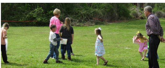
Above : Highland Easter Egg Hunt