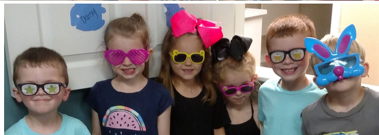
Above: Mountville's Team Kids enjoying Crazy Glasses night