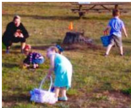
Above: Scenes from Easter at New Hope - LaGrange

Roper Heights - had a great month with good attendance and good Bible studies.