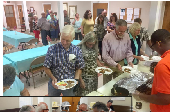
Bi-vocational Pastors' Rib Day