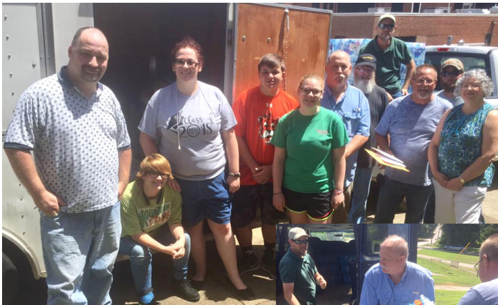
Georgia Baptist Children's Home Truck-loading Event