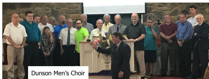
Dunson Men's Choir