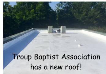
Troup Baptist Association has a new roof!