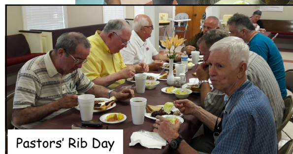
Pastors' Rib Day