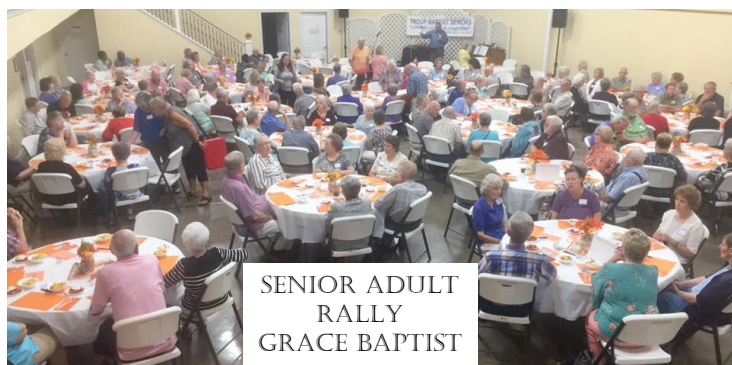
SENIOR ADULT RALLY GRACE BAPTIST