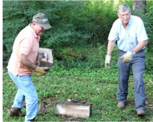
At Left: Men's workday at Grace Baptist Church