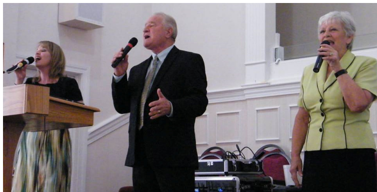
Above: The Revelations from Warm Springs, GA