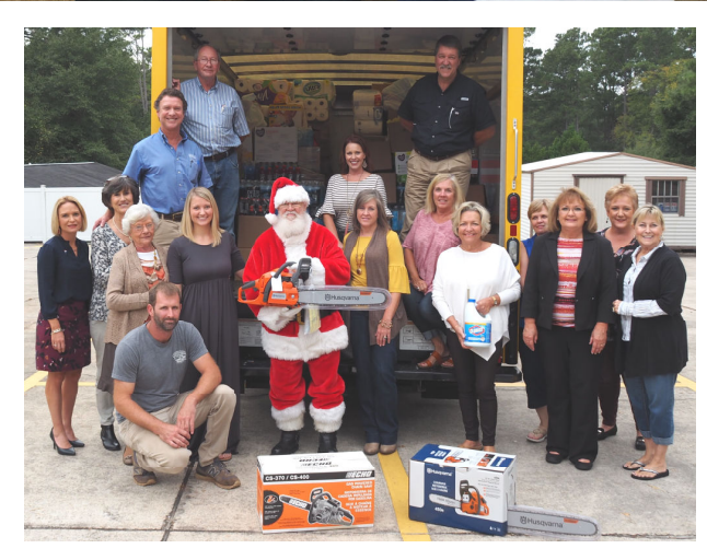
Unity / Callaway - In response to the devastation that resulted from Hurricane Michael - Unity Baptist Church, Callaway Baptist Church, Troup County Board of Realtors and affiliates, and numerous residents of LaGrange and West Point gathered much needed supplies and traveled to Donalsonville, GA, (the hardest hit area in Georgia) on Sunday, October 21 delivering the supplies to First Baptist Church of Donalsonville.