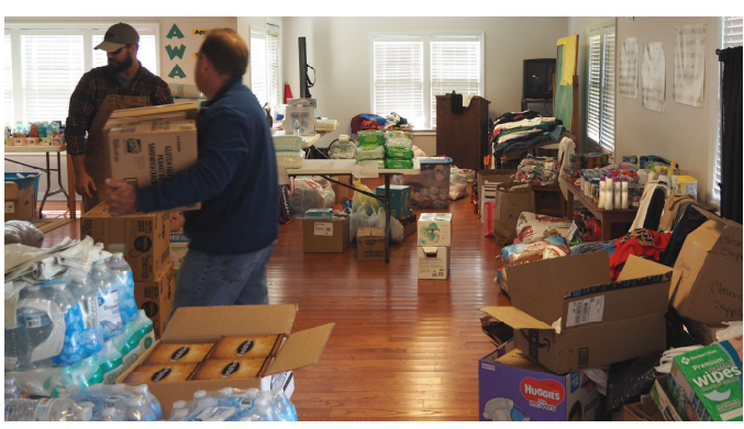
Above & Below left: Items donated included four chain saws, chain saw blades, oil and gas, diapers, wipes, toiletries, food, water and clothing. The devastation was incredible but so was the spirit and gratitude of those receiving these gifts. A big thanks to those who donated!

Baptist Tabernacle (BTC) - The Lighthouse Keepers is open to all senior adults (55 or older). The purpose of the Lighthouse Keepers is for the senior members of the church to continue doing the work that the Lord would have them to do for the church and the community. Each month they prepare a meal for family and friends of those in Hospice care. They also donate bottles of water to Hospice. They host Bingo at Florence Hand Home on the third Thursday of each month. Each year they do a project for the Battered Women's Shelter. • Sunday, November 11 is Veteran's Day. Please remember to say "thank you" to those who have served and are serving today. • BTC will be hosting a Blood Drive on November 26 from 2-7pm in the Life Center at BTC. "Please donate so others may live."