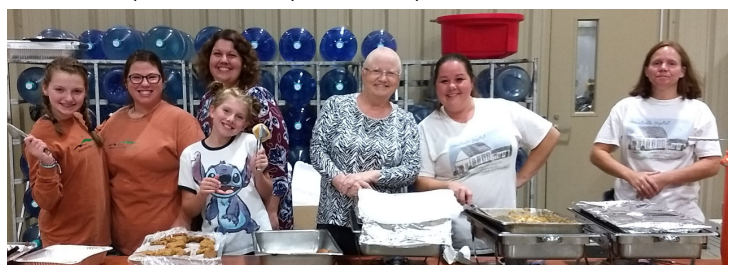
Above: Mountville members who served Utility Crews in South Georgia