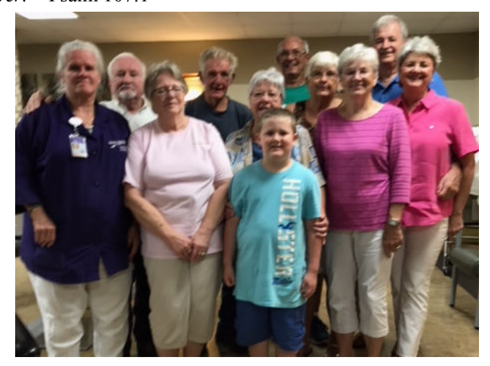
Above: The Lighthouse Keepers (plus one junior member) from Baptist Tabernacle