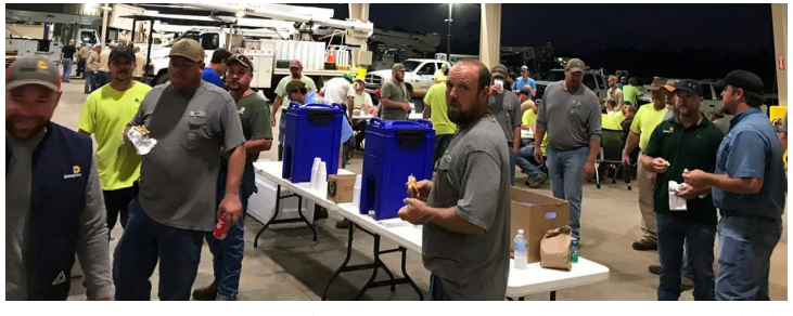
Above: Utility Crews who helped restore power after Hurricane Michael