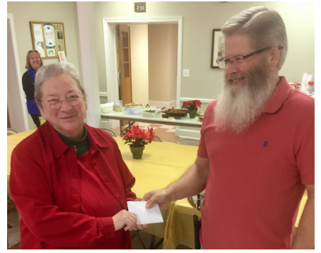
Faith Bible Institute Christmas Party

• Creekside had a wonderful Spirit-filled New Year's Eve singing with Segos The Next Generation from Macon, Ga. and Trinity from Reynolds, Ga. The crowd enjoyed breakfast at 10pm and the altar was full of people praying in the New Year at midnight.