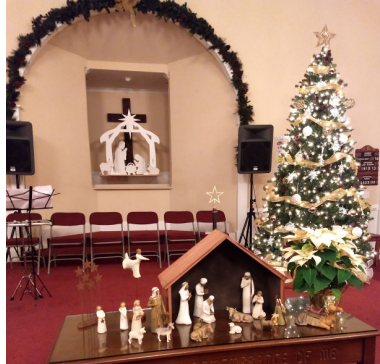
Above: MBC Grade 3-5 SS Class Above: MBC Sanctuary at Christmas