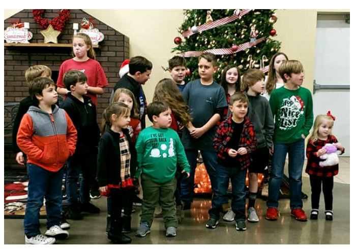
Above: Grace kids waiting on a special guest to arrive for their Christmas party.