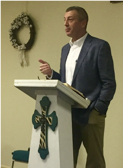
HARVEST BAPTIST CHURCH