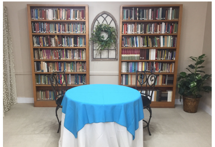
Above: The Audio Visual Studio at Troup Baptist Association

Association - The finishing touches are being applied to the audio visual studio of the Troup Baptist Association. Several recording sessions are scheduled and in the near future there will be several training videos available on our website. The purpose of this studio is to provide "on demand" training and information. The videos will be available to anyone interested. Visit our website, www.troubaptist.org and click on the Videos tab.