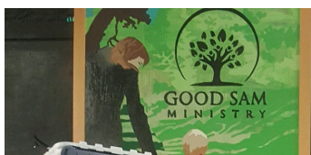
The Mountville Mpact Team packed bags for the Good Sam Ministry on January 19.