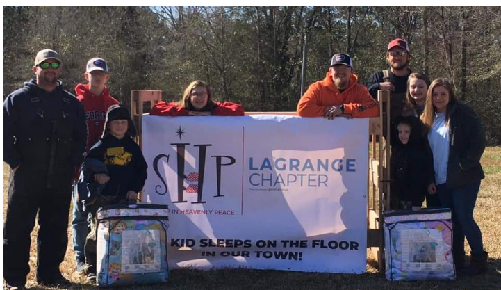
Mountville Mpact helped to make beds for the "Sleep in Heavenly Peace" mission project on Saturday, January 26.