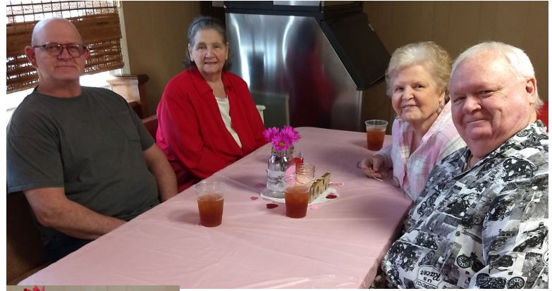
Above: Valentine Banquet sponsored by the Mountville MPact group.