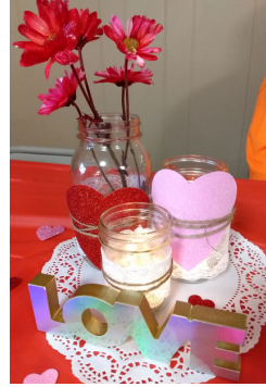
At Left: Valentine Table Decorations