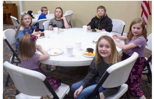
Above: Grace Sunday School kids enjoying breakfast before classes. Below: Grace Sunday School Kids