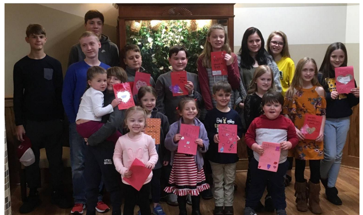
Above: Grace kids and youth take Valentine's Cards they made to give to the Nursing Home residents.