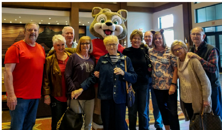
Above: A group from Unity Baptist toured the Great Wolf Lodge.

• The Lifeline Youth Ministry at Unity have recently enjoyed lock-ins, game days and community outreach days. There are also a lot of good things planned for April! • A group of Unity members toured the Great Wolf Lodge and enjoyed time together over an incredible lunch! • The Children's Church has started a new session called, "Bible Art - Creating Art with God." In Awana's, the children are working hard on their books to complete before the end of year. They are also getting their cars ready for the Awana Grand Prix in April.