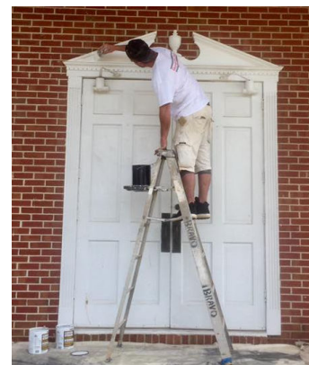
Painting the Front Entrance