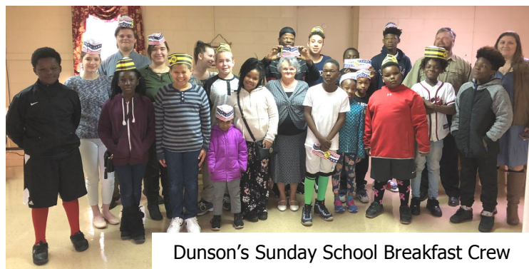
Dunson's Sunday School Breakfast Crew