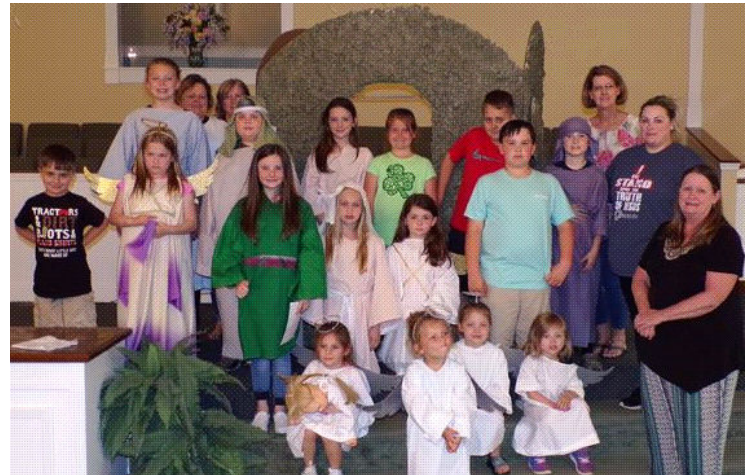
Above: Cast of Grace Baptist Children's Easter Play Below: Scenes from the Easter Play