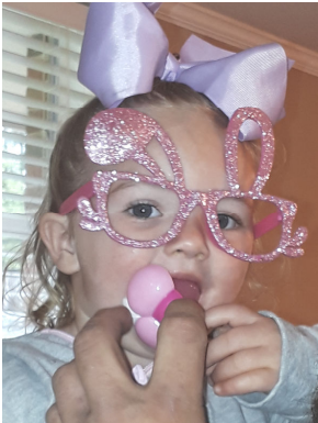
Davidson: Egg Hunt (above) Easter Reenactment (below)

Davidson - had a great Easter Egg Hunt on April 20. On Easter they had a sunrise service and later enjoyed an Easter Reenactment. (see Photos below)