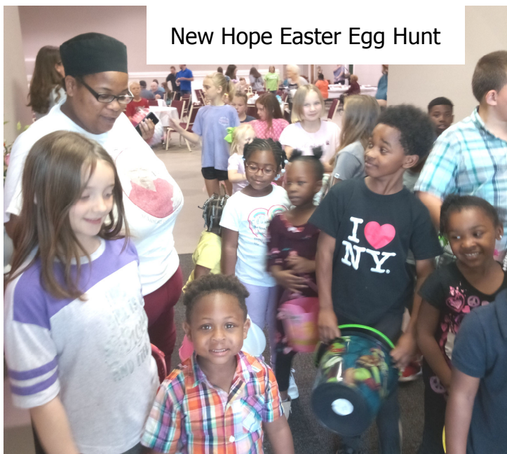
New Hope Easter Egg Hunt