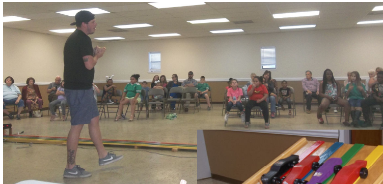
Above & Right: Unity Awanas are getting ready for their Grand Prix which was held on April 24. The children enjoyed painting, assembling & racing their cars.

• CMG (Current Mission Group) had the Salad and Sandwich Luncheon after the morning worship service on April 14. CMG met on April 15 and planned the Mother/Daughter Luncheon for May 18 at 11:30 am. • The Food Closet passed out food on April 23 serving several families in the community.