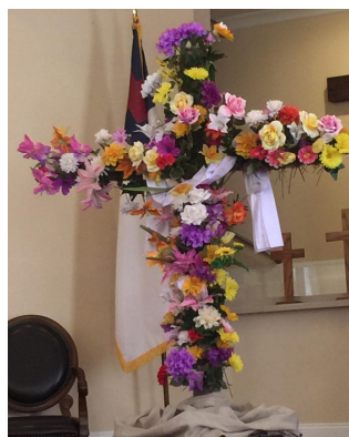
The Living Cross