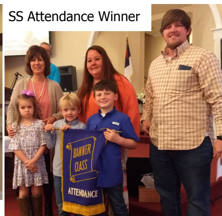
SS Attendance Winner