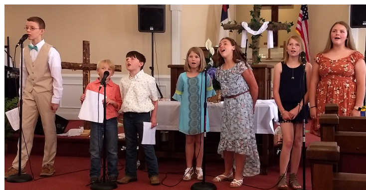
Above: Children's Easter Musical at Mountville