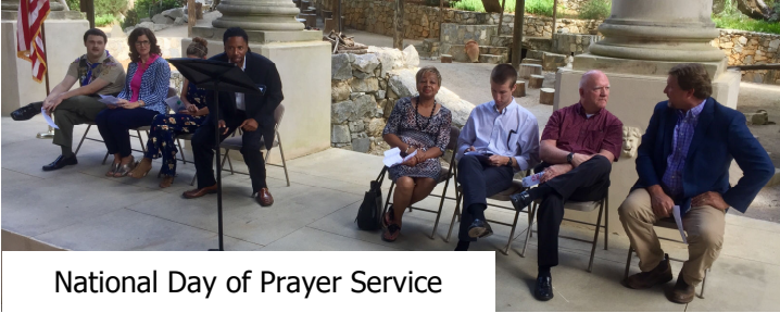
National Day of Prayer Service