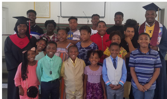
Above: Youth of New Macedonia Missionary Baptist Church