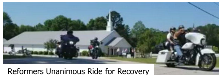
Reformers Unanimous Ride for Recovery