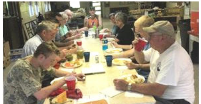
Grace Mission Trip to Barbourville Kentucky

Grace - The mission crew from Grace went to Emmanuel Bible Camp in Barbourville, Kentucky to help with much needed repairs. • Grace Kids took cookies to firemen, flowers to the nursing home and had a 5th grade graduation celebration at Surge Trampoline Park. • Reformer's Unanimous held their First Annual Ride for Recovery to raise money for their leaders to attend a conference in Chicago.