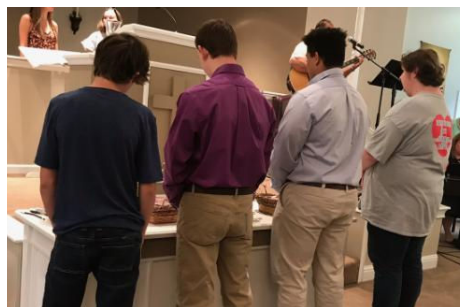
Left: New Hope Youth conducted the Mother's Day service