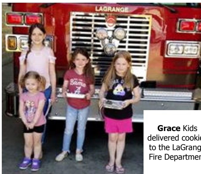
Grace Kids delivered cookies to the LaGrange Fire Department