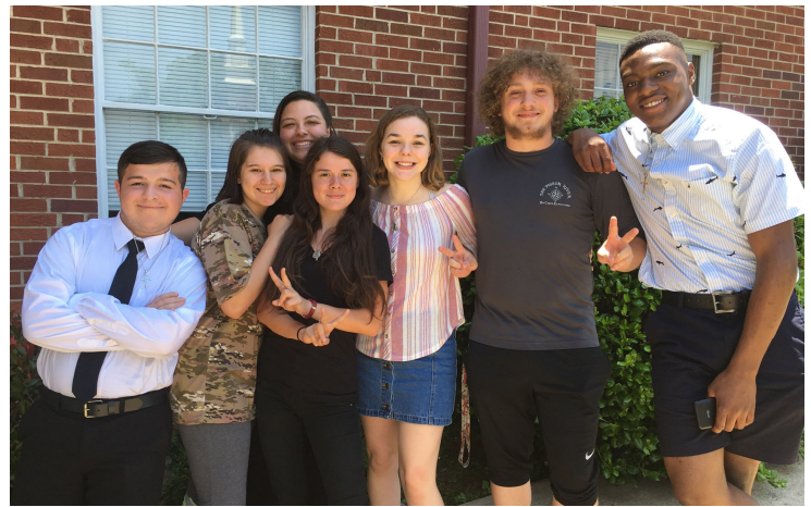
First Baptist Church of Hogansville 2019 Graduates