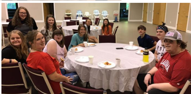
Below: New Hope's Youth Group