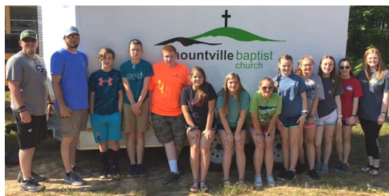
Above: Mountville MPact attended RUSH 2019