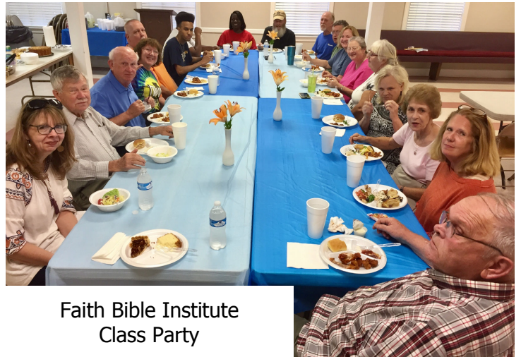
Faith Bible Institute Class Party

Faith Bible Institute held a class party on May 21 after their semester final. Spouses of the students were invited to join in the celebration. For information about Faith Bible Institute see the announcements page in this newsletter or visit our website www.troubaptist.org/Faith Bible Institute .