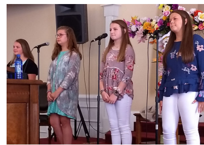
Above & Below Right: Mountville Youth Day Service