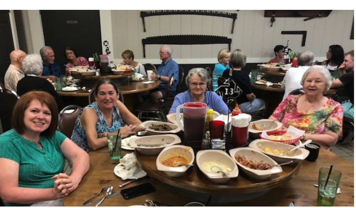
Dunson Above L-R: Youth baking cookies for visitation, Girls & Boys Club Bus Trip to the Georgia Aquarium, and Dunson Adults bus trip to Bruckner's Family Restaurant