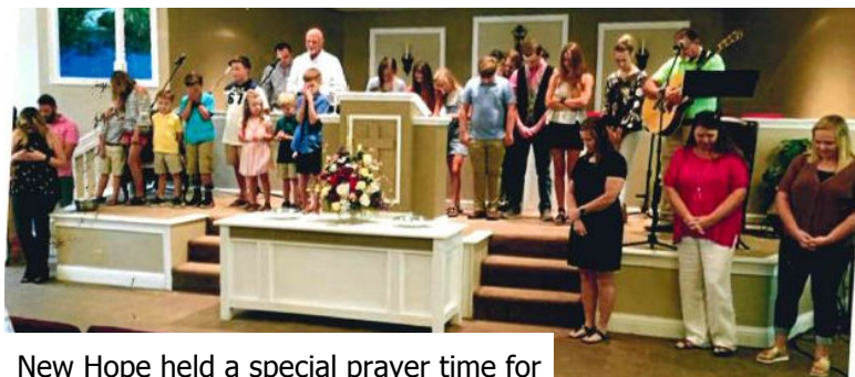
New Hope held a special prayer time for students and teachers on August 11.