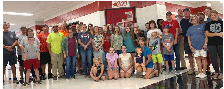
Mountville Baptist Congregation at their Prayer Walk for Callaway High School on August 7