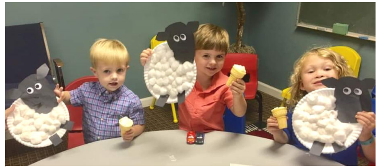
Mountville Children's Church Juniors