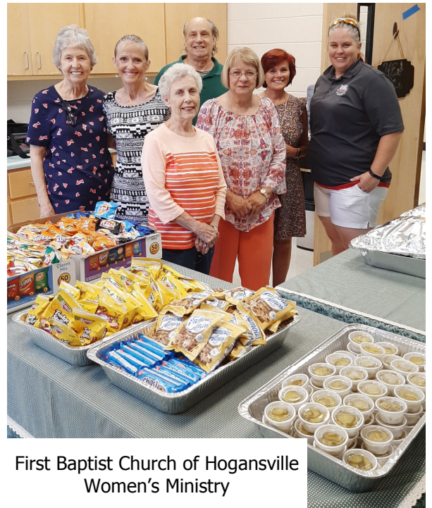
First Baptist Church of Hogansville Women's Ministry