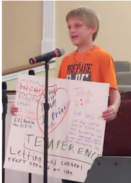
At Right: Reformer's Unanimous Kidz Club member speaks at the graduation