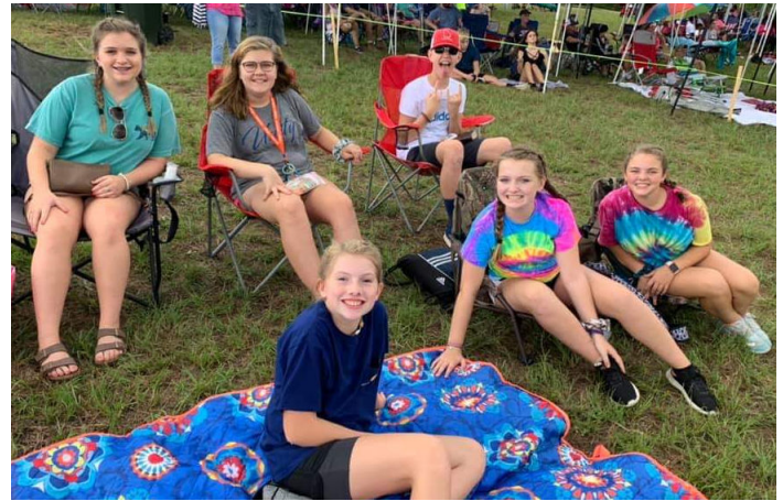
Mountville Mpcat at En Fuego 2019 on August 24