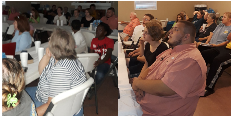
Above: Davidson Baptist Youth Back-to-School Bash