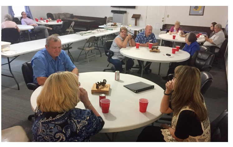
Wehadkee's Friday Night Fellowship Group