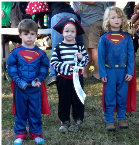
Mountville Fall Festival