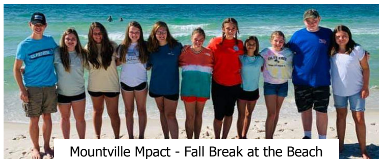
Mountville Mpcat - Fall Break at the Beach