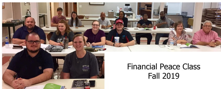
Financial Peace Class Fall 2019