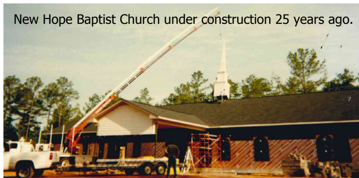
New Hope Baptist Church under construction 25 years ago.