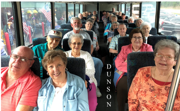
Dunson Baptist Bus Trip to Blue Ridge, Georgia

Dunson - On October 8, Dunson Baptist Church took their bus to Blue Ridge, Georgia for apples and a nice meal. Members from New Hope Baptist, Shoal Creek, Unity, and Dunson joined together for the trip and had a wonderful time. • On Thursday, October 10 at 6pm, Dunson started a new contemporary service called "Thrive Alive!" It is a "come as you are" service held in the fellowship hall and includes contemporary Christian music and food. The next meeting will be announced. Hope to see you there! • The girls ministry took a trip to Six Flags after church on October 13. The entire youth group had a lock-in at the church that same night with a big breakfast served the following morning.