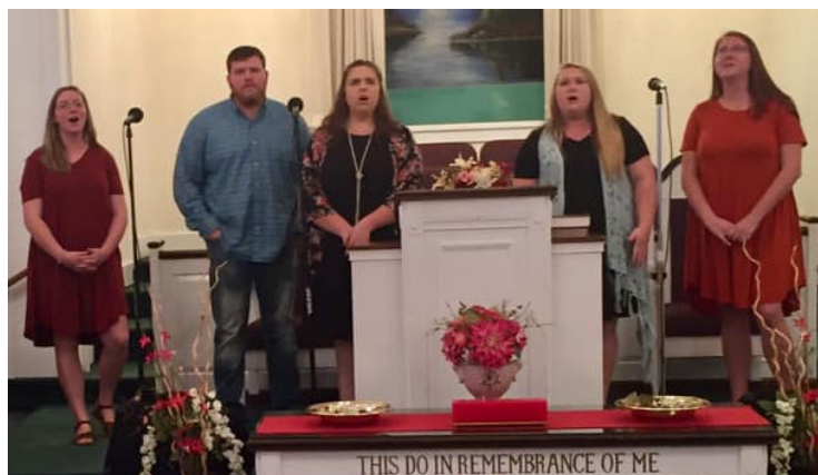
Hillcrest Baptist Church Praise Team