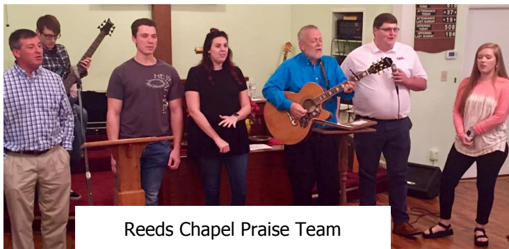
Reeds Chapel Praise Team