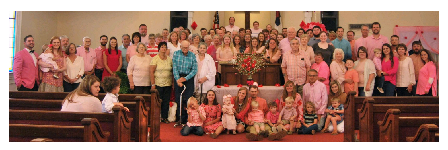
Mountville Congregation Pink Out Sunday in recognition of Breast Cancer Awareness Month in October

Left: Mountville Mpact group participated in the Fields of Faith event.