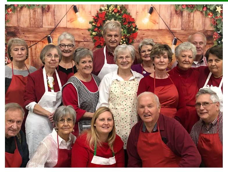
Baptist Tabernacle Kitchen Crew