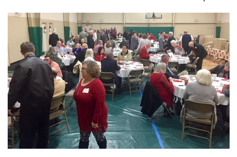
The Pastors' & Wives' Christmas Party