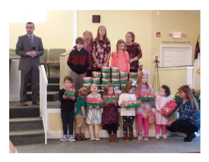
Operation Christmas Child Complete!