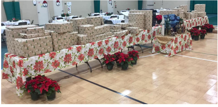
The Gifts for the Pastors' & Wives' Christmas Party