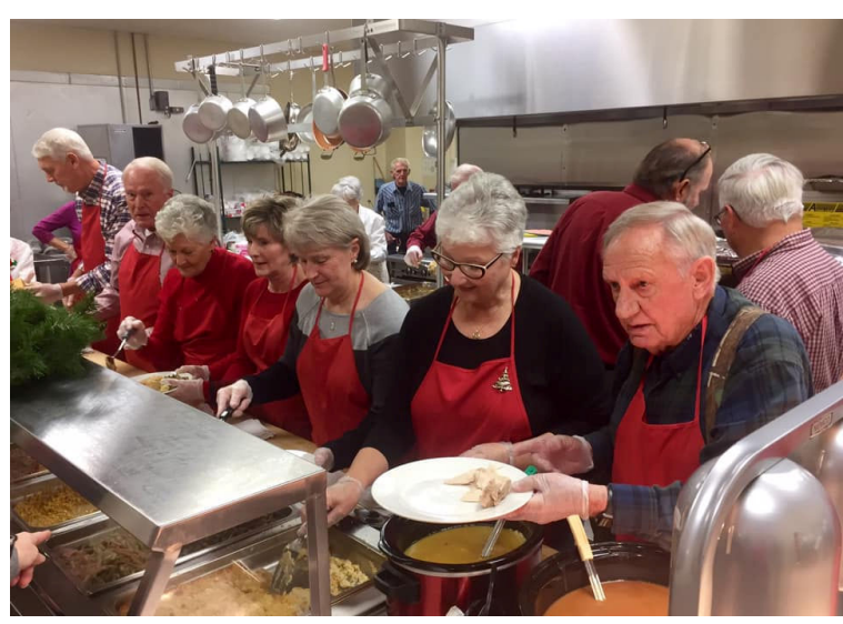
The Kitchen Crew at Work