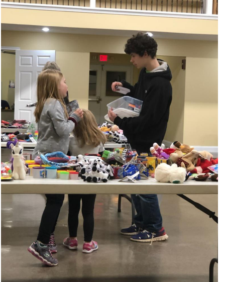
Preparation for Operation Christmas Child at Grace Baptist