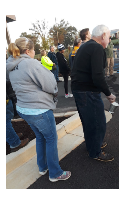
Sleep in Heavenly Peace Event held at Davidson Baptist Church in West Point, Georgia