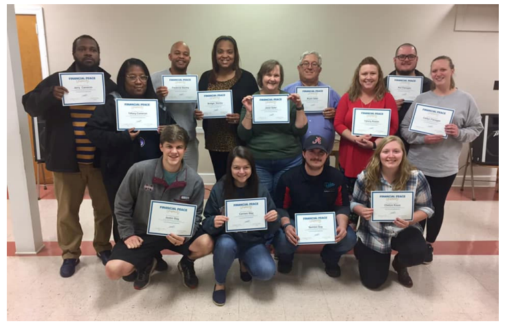
Financial Peace University Fall Graduates This 9 week course will be offered again beginning in January.