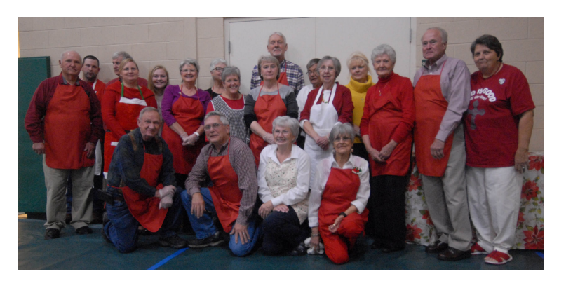
Baptist Tabernacle Kitchen Crew