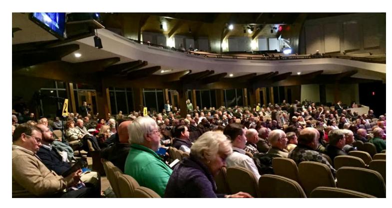
Georgia Baptist Convention - Annual Meeting