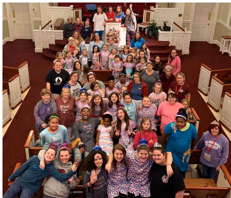
First Hogansville's Pampered Princess Pajama Party for Girls

• On February 22, the Women's Ministry sponsored a Pampered Princess Pajama Party for girls between the ages of 4 years and early teens. The Fellowship Hall was beautifully decorated with a number of stations set up for games, crafts, and karaoke, as well as delicious refreshments. The stations were designed to help the girls learn how God loves each of us just the way we are, how we should treat one another and that each one has a purpose. There were 37 girls and 27 youth and adult volunteers in attendance. "Everyone had an amazing time and we thank God for His blessings!" See photo below.