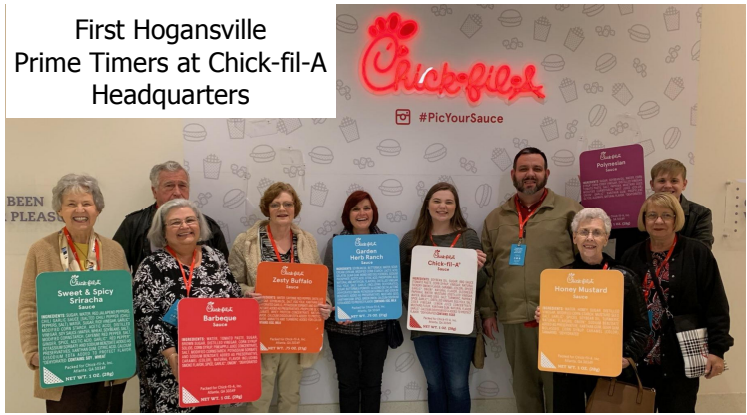
First Hogansville Prime Timers at Chick-fil-A Headquarters