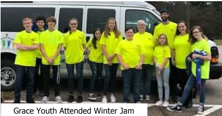
Grace Youth Attended Winter Jam