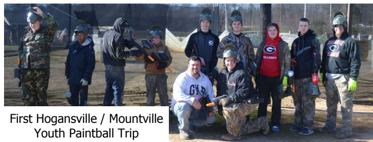
First Hogansville / Mountville Youth Paintball Trip