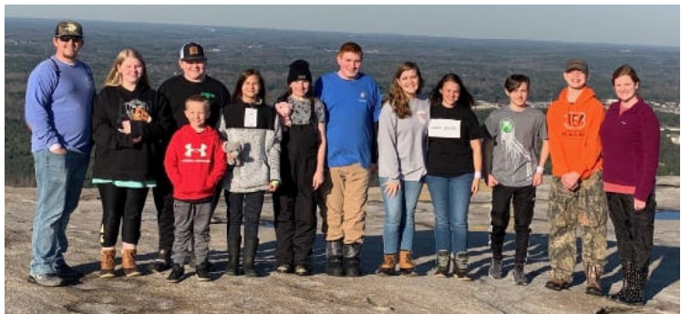
Mountville's Mpack Group on Stone Mountain