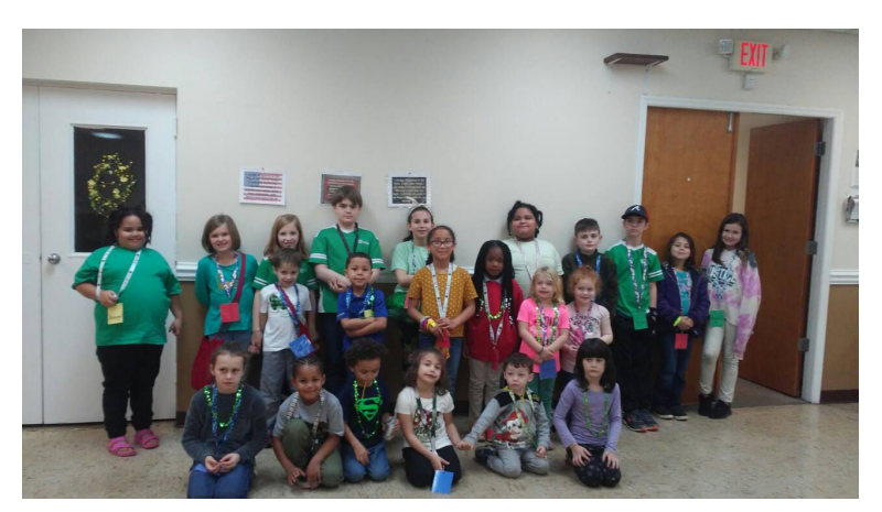
Unity Awanas: Held Wear Green Night on March 11