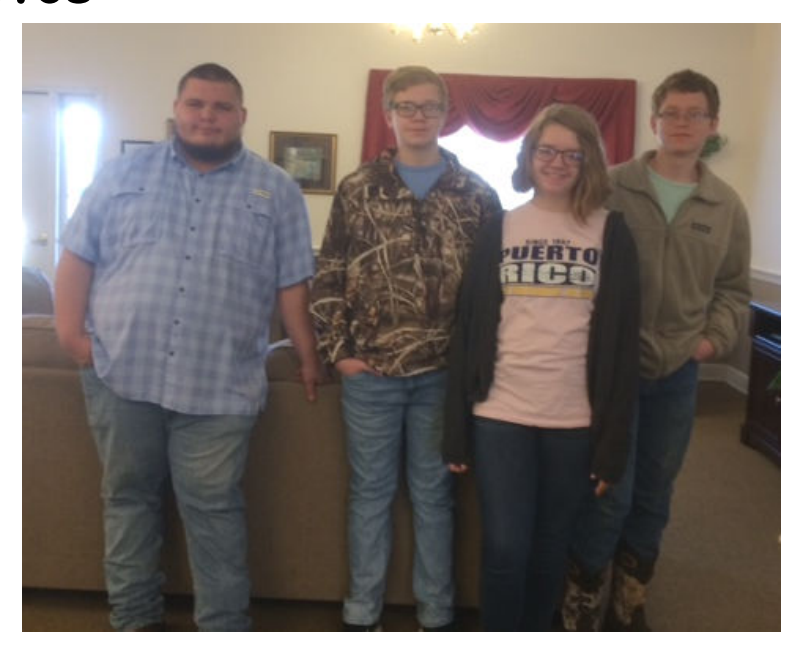
Davidson Youth visited Lakewood Assisted Living.