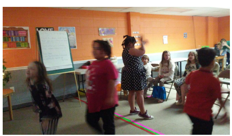
Unity Awanas: Held Comfy Cozy Night on March 4