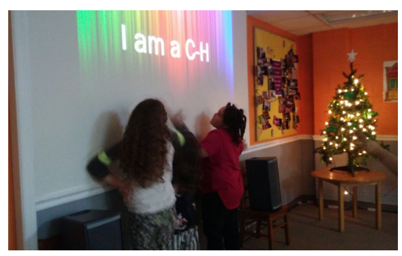
Unity Awanas: Singing Their Favorite Song, "I Am A C H R I S T I A N"