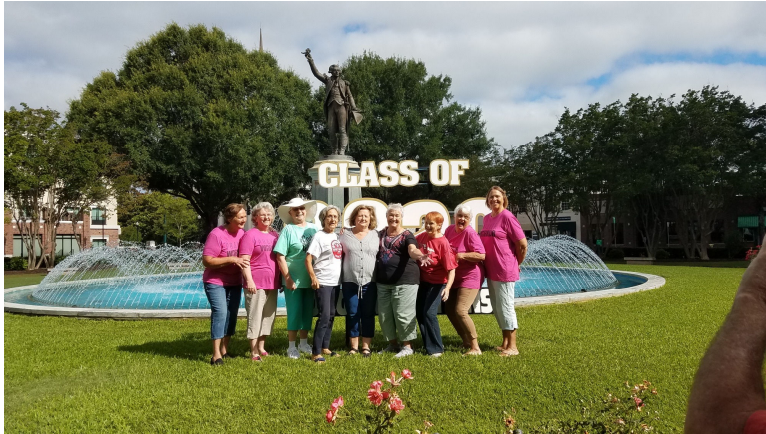
Baptist Tabernacle Church