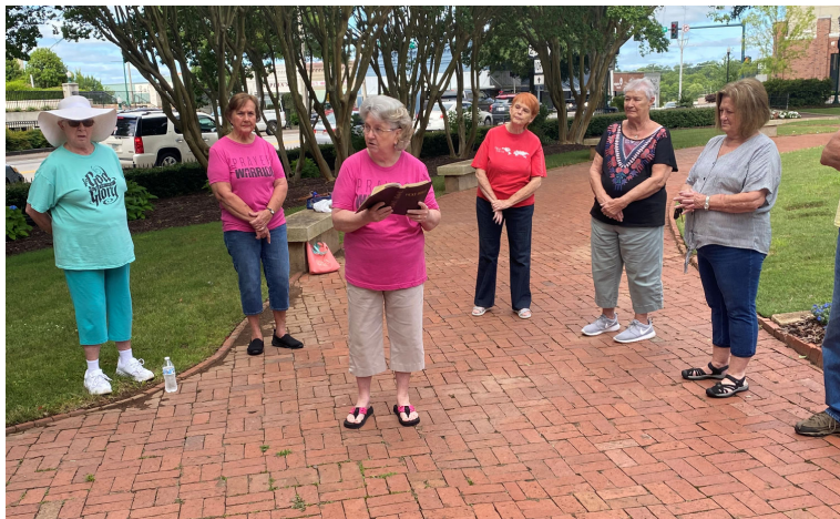
Above: BTC Prayer Warriors have been going to the square in LaGrange and praying for our country.