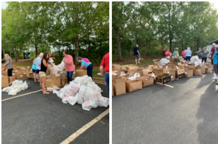
Above: Baptist Tabernacle holds weekly food and clothing closets and held a mobile food drive with Feeding the Valley on June 6. They will have another mobile food drive on July 25 from 10am until 12 noon.