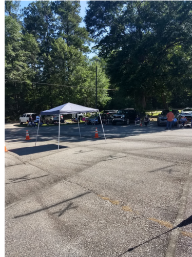
Mountville Baptist / Outdoor Church