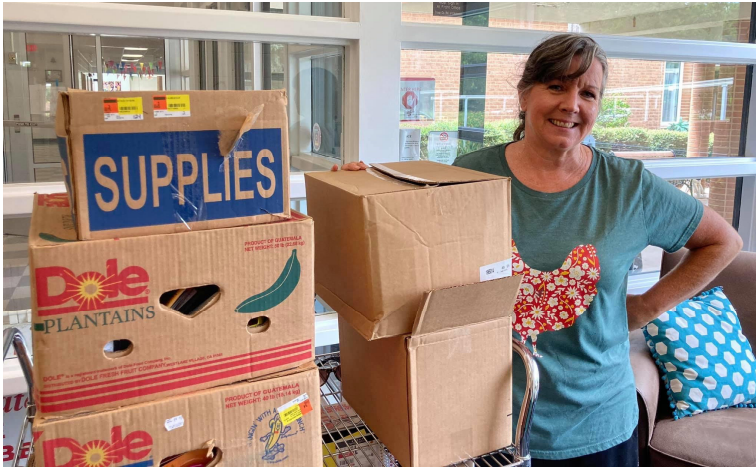
Above: The Ladies of Grace (Grace Baptist Church) donated school supplies to Long Cane Elementary School.