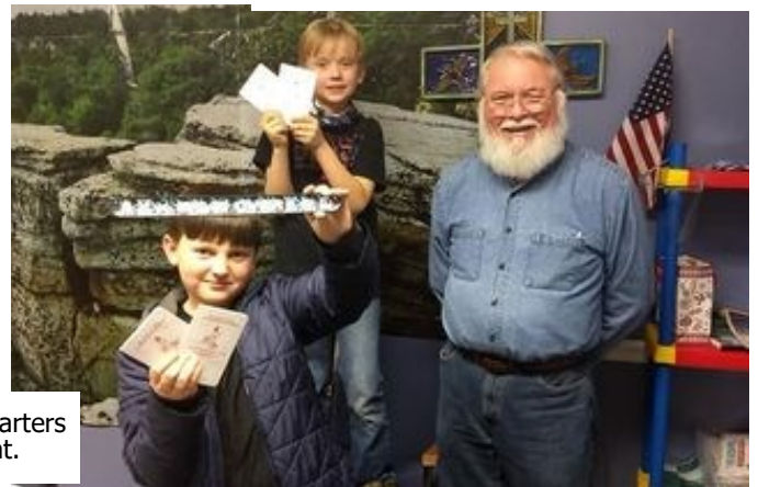
Mountville Wed. Night Team Kids raised over $50 in quarters for the Children's Lighthouse Ministry. Photo at right.