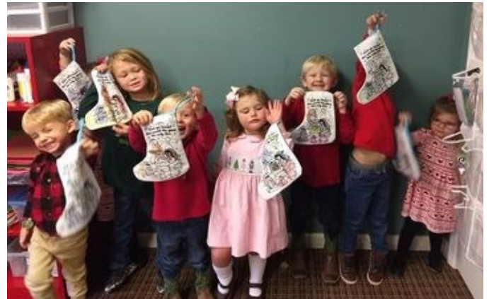
Mountville Little Children's Church learned about the greatest gift of all...JESUS!