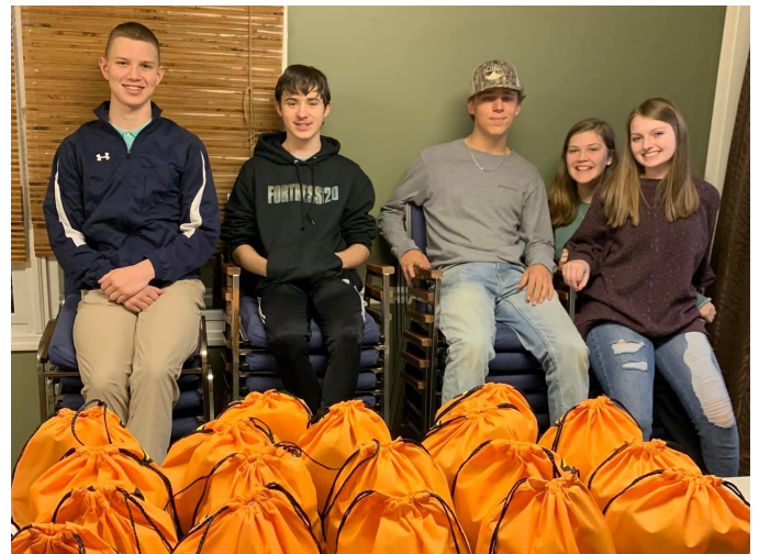
Mountville Mpact group with their "Blessing Bags" for members of the community in need.