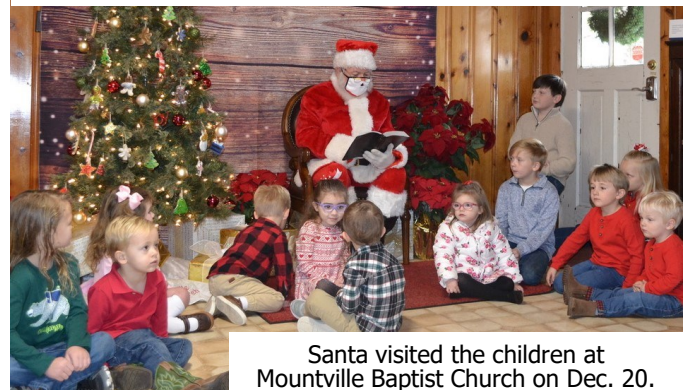
Santa visited the children at Mountville Baptist Church on Dec. 20.