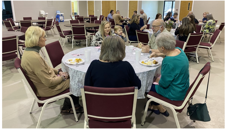
Above: New Hope LaGrange members enjoying their Easter Family Night Supper.