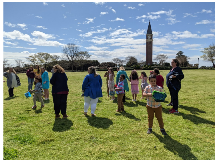
Above: Unity Baptist Church - The Children enjoyed an Easter Egg Hunt at the Clock Tower on March 21.