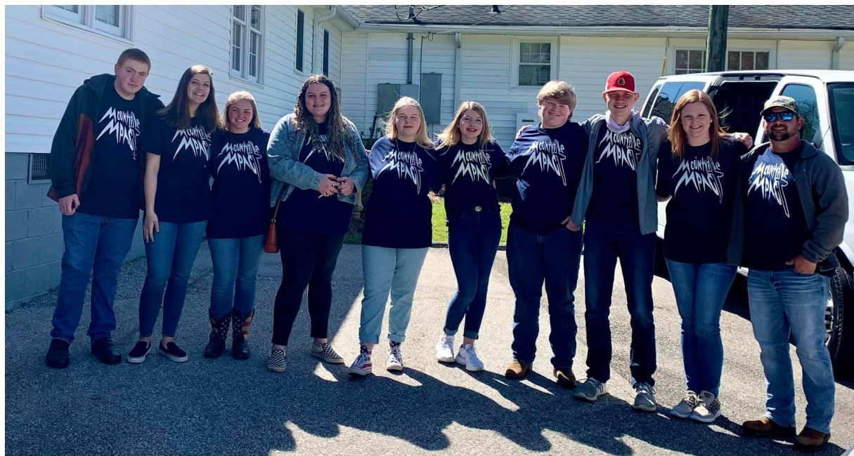
Above: Mountville Baptist Church MPact went to Winter JAM on Saturday, March 20