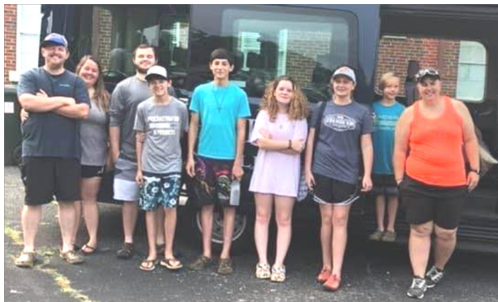
Above: FBC Hogansville Youth traveled to Helen, Georgia for a day of tubing.