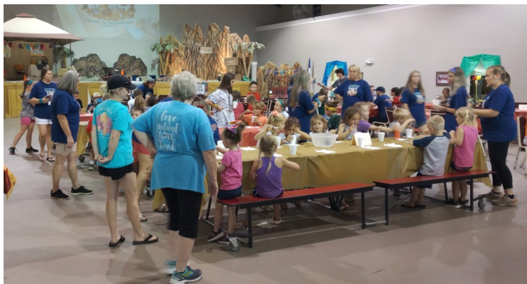
Above: New Hope LaGrange Vacation Bible School