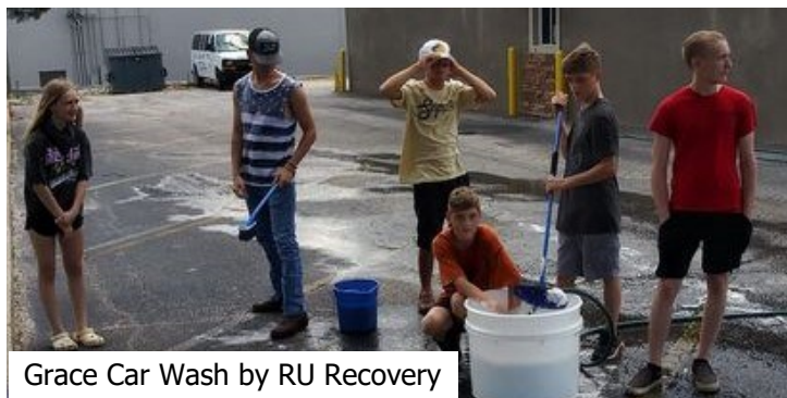
Grace Car Wash by RU Recovery

Join Grace for Sunday School at 9:45 am, morning worship in the sanctuary at 10:45 am, evening Discipleship Training at 6:00 pm and Wednesday service at 7:00 pm. Children PreK through 3rd grades and Teen Ministry 4th grade through age 20 will meet in the George Harris Building during Sunday and Wednesday services. All services will be streamed live on Facebook and will also be available on YouTube. Please visit the website www.gbclagrange.com for updates and links to their Facebook page and YouTube channel. Search for Grace Baptist Church LaGrange Georgia & RU Recovery Ch. 1078.