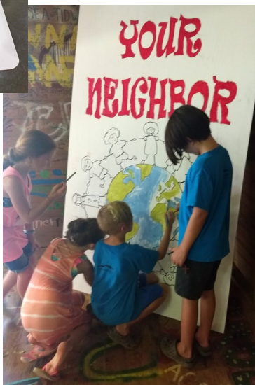
At Right: Mountville kids learned about the love of Jesus and painted a mural reflecting that message at Camp Viola.