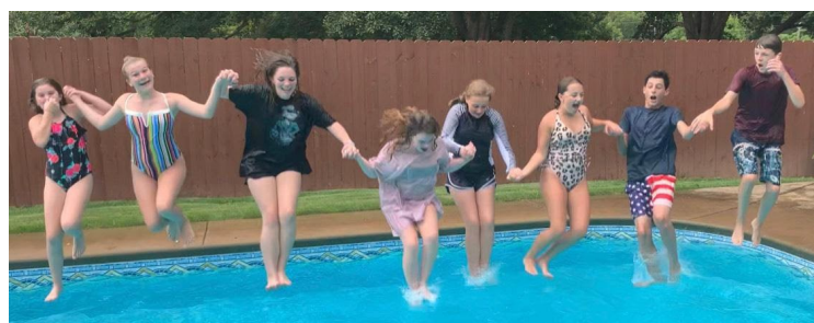
FBC Hogansville Back to School Bash & Pool Party