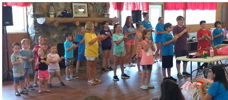
Mountville's Back-to-School Bible School at Camp Viola