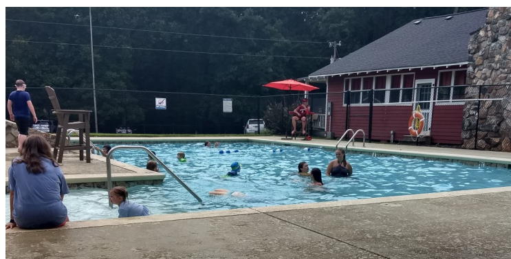
Mountville Kids Back-to-School Bible School at Camp Viola.