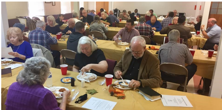
Above: Attendees enjoyed a BBQ lunch following the Annual Meeting held on Monday, October 18.