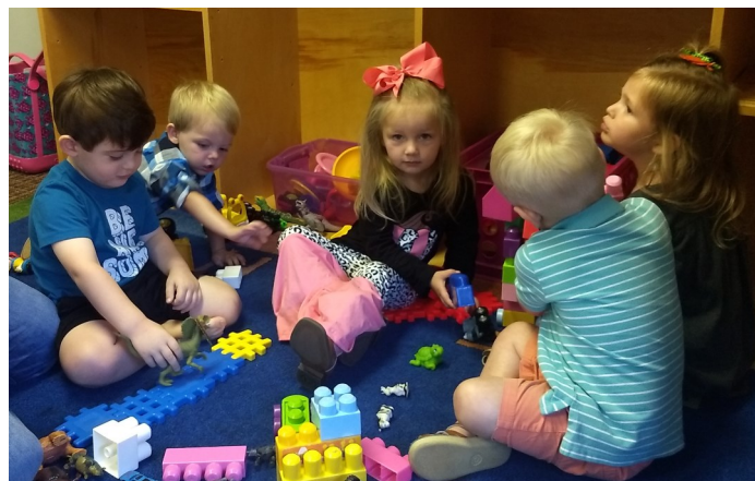
Mountville Baptist Church - Preschool Class