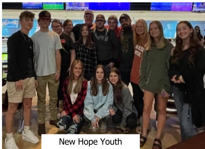
New Hope Youth

• "We look forward to seeing you at our Thanksgiving Dinner on Wednesday, November 17 at 6 pm. Everyone is encouraged to bring a friend, a co-worker, a neighbor or a family member with you to celebrate the goodness of God together and reach out to others with the gospel."