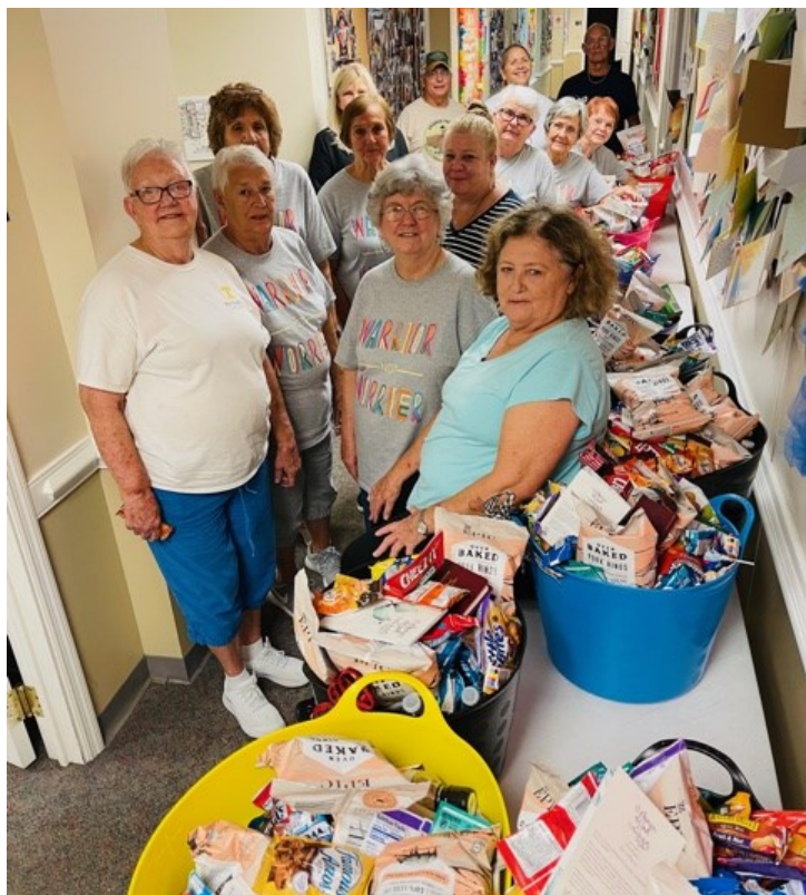
Baptist Tabernacle participated in the October Community Mission Project for Wellstar West Georgia Medical Center.

• Brotherhood will have their annual Men's Christmas Breakfast on Friday, December 24 at 8:00 am. • Baptist Tabernacle wishes each of you a very Merry Christmas and a Happy New Year. "May God bless you and your family."