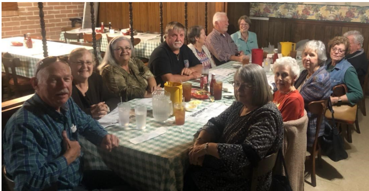
FBC Hogansville's Grapevine Sunday School Class outing to Riverbend Restaurant in Thomaston.