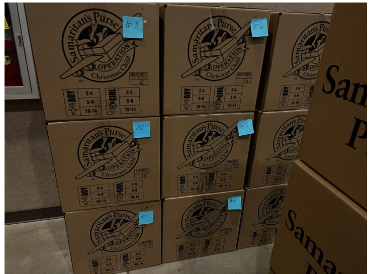
Operation Christmas Child - Cases of Shoe Boxes