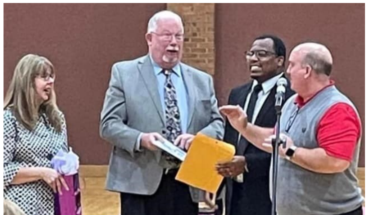
Above: That look of surprise when you find out that you are going on an Alaskan Cruise!