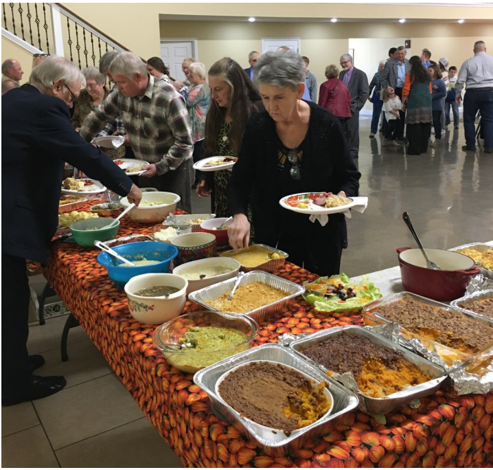
Above: Grace's Thanksgiving Dinner on November 21