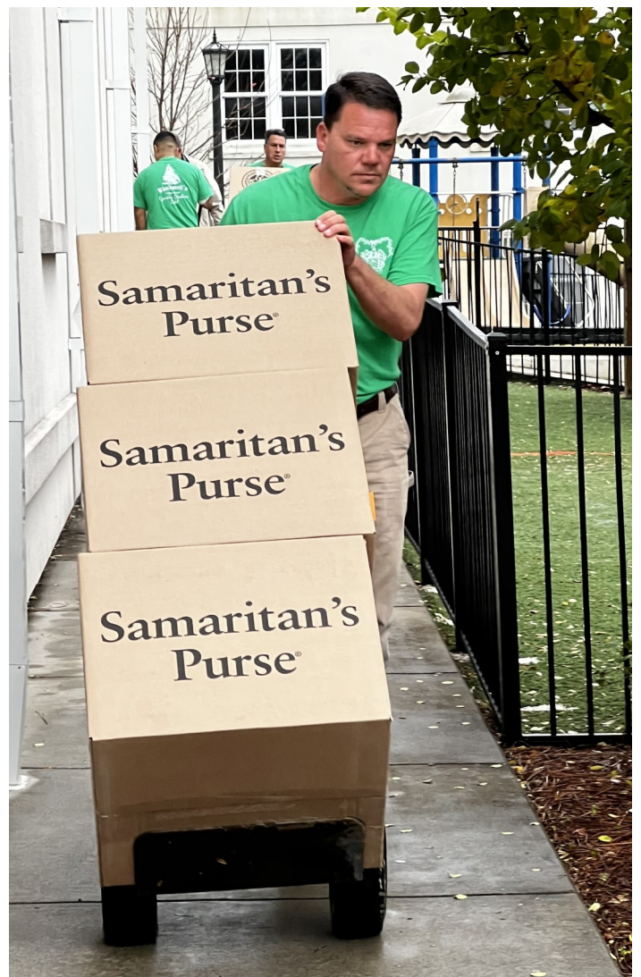
Operation Christmas Child boxes being loaded from the collection center at First Baptist on the Square in LaGrange.