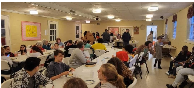
Wednesday Evening Meal at First Baptist Hogansville

FBC Hogansville - In this new year they are continuing the study of the Word and personal growth with the groups Building Godly Men and Ladies Under Construction which meet every Tuesday evening at 6:00 pm. Then Wednesdays are always exciting times at First Baptist with a meal from 5 to 5:45 pm, children's classes from 6 to 7 pm, and adult Bible study from 6:30 to 7 pm, followed by choir practice for our singers. We have a place for everyone and everyone is invited to join us. • Celebrate Recovery meets at 3:00 pm every Sunday afternoon. There is always encouragement to be found and fellowship to be enjoyed at these meetings. Don't forget to tune in to their podcasts for timely, constructive comments delivered with down-to-earth humor. • Excitement is in the air about Revival at First Baptist Church coming on Monday, February 7 at 7 pm. On that night Pastor Benny Tate of Rock Springs Church, Milner, Georgia will be the guest speaker. Pastor Tate always delivers a powerful message, and he will bring the Rock Springs Choir to bless us with music. We hope everyone will come that evening to take part in a mighty revival.