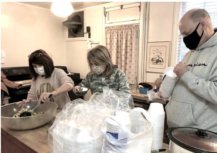
Rosemont Baptist Church Volunteers