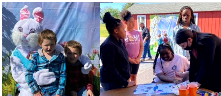
Dunson Easter Egg Hunt & Hotdog Luncheon