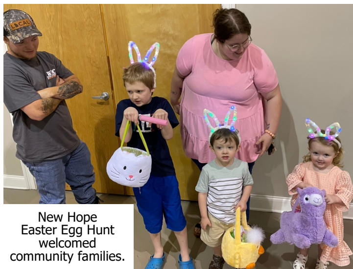
New Hope Easter Egg Hunt welcomed community families.