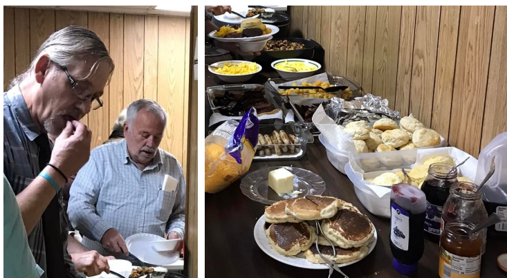
Above: Gray Hill's Easter Sunrise Breakfast