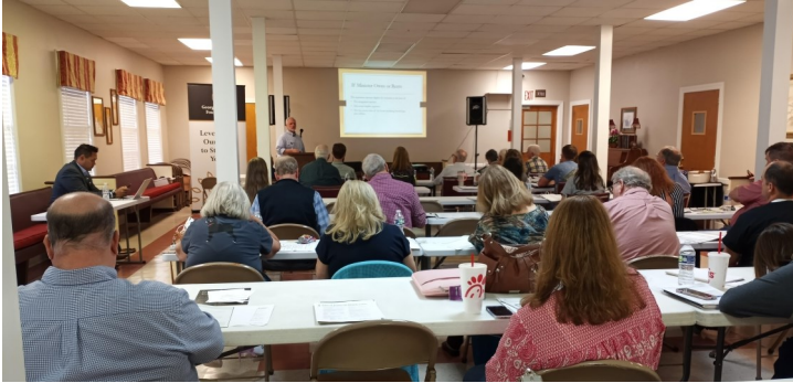
Church Financial Compliance Seminar on April 7