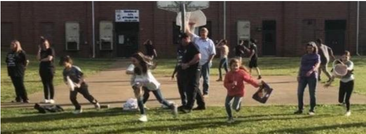
FBC Hogansville Easter festivities included an egg hunt for the children on Wednesday evening, April 13.