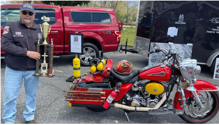
Celebrate Recovery hosted a classic car show on April 9 which brought a large crowd to view vehicles from the late 1920s to more current models. Trophies were given in several categories. The winner in the motorcycle category was a 9/11 Tribute Bike honoring the firemen who answered the call on that tragic day. The event raised over $2,500 which will go toward helping people recover from addictions. The group meets at First Baptist every Sunday at 3 pm.