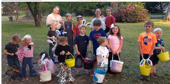
Mountville Kids Easter Egg Hunt

New Hope (LaGrange) - The Easter Egg Hunt was a success despite the rain on Saturday morning, April 16th. The activities were moved inside to the Worship Center, Sunday School classrooms and the Family Life Center. Besides the egg hunt, there was face painting, bean bag toss, jumping jack, a place for families to take Easter pictures, and flavored ice cones. Each child who attended was given a bag with candy and a church tract presenting the plan of salvation. Everyone had a great time. • The youth meet each week on Wednesday evening at 6:00. A meal is served before class and activity time. If you have a youth who is not attending a youth group anywhere, you are cordially invited to join them at New Hope where summer activities are being planned. • Please mark your calendar for VBS from July 18 to 22 beginning at 9 am. All children through 5th grade are invited. • A church-wide picnic will be Sunday, May 15 after the worship service at Hardley Creek Park in Lanett, AL (at the dam), shelter A. Bring a side dish or a dessert. The church will provide pulled pork sandwiches and bottled water. Everyone is invited, so bring your lawn chair and enjoy the afternoon food and fellowship. • Very soon school will be over for the year. We pray that all our students and teachers have a very wonderful, safe, and blessed summer vacation.