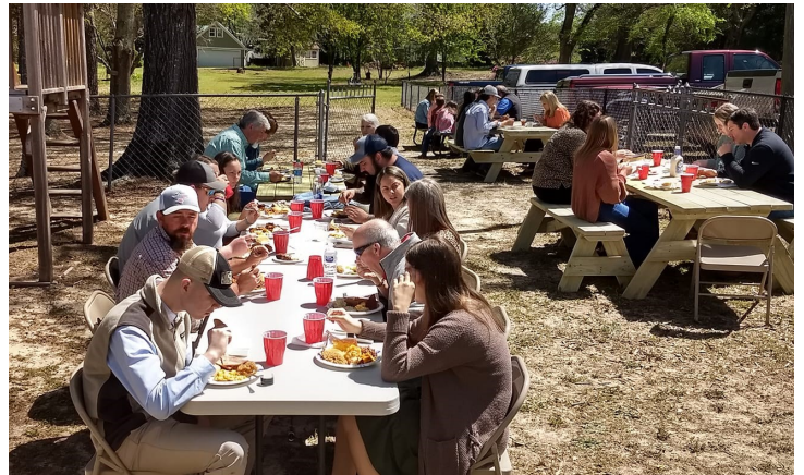
Mountville Baptist Church enjoyed a beautiful homecoming service on Sunday, April 10 with lunch on the grounds!