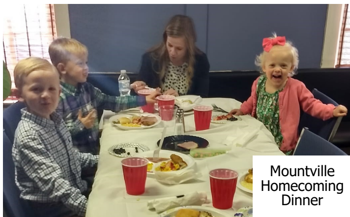
Mountville Homecoming Dinner