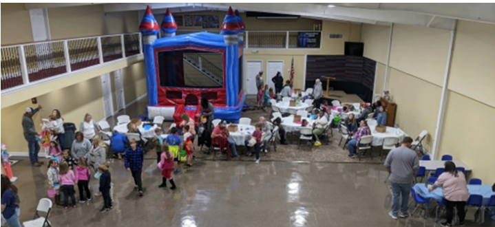
Above & Below: Grace Baptist Church Children's Easter Activities