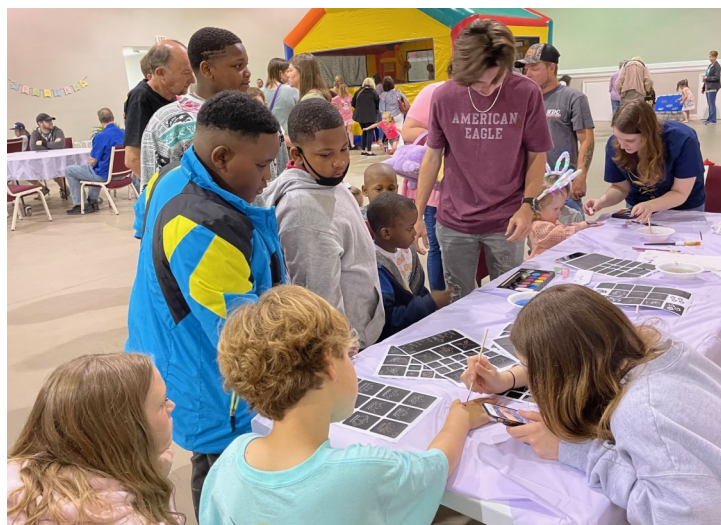
Above: New Hope Children's Easter Activities