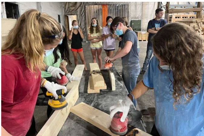
FBC Hogansville Youth built beds for Sleep in Heavenly Peace.