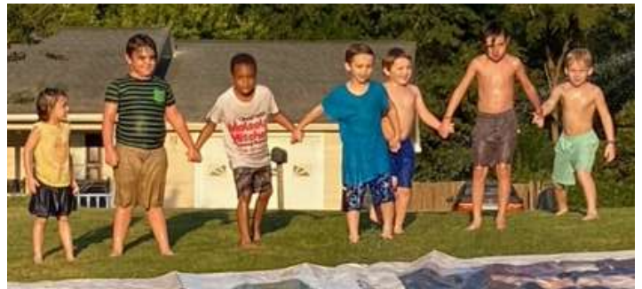
Above: Dunson Kids enjoyed a water slide at VBS.