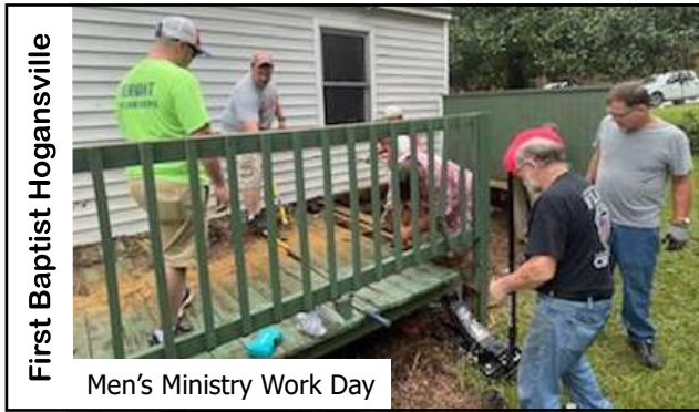
First Baptist Hogansville