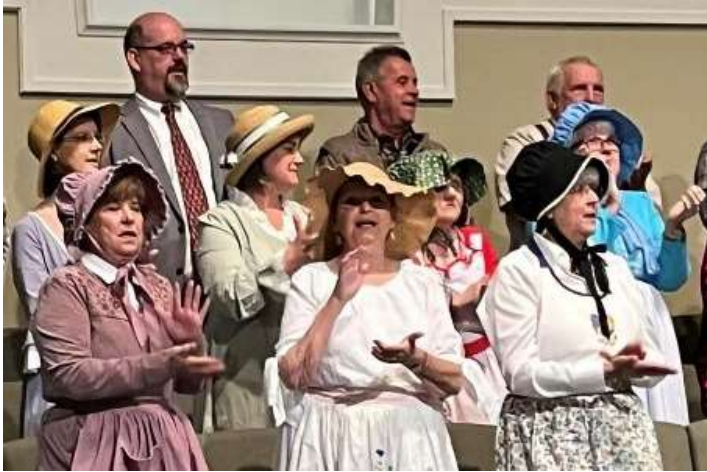
Old Fashion Homecoming Day at Baptist Tabernacle

• There will be a Trunk or Treat on Monday, October 31, from 6 to 8 pm. Candy will be given to children. There will be cake walks, hot dogs, chips, pickles, popcorn, and drinks for sale. "Come and enjoy a fun and safe evening for everyone. HAPPY FALL from Baptist Tabernacle Church!"