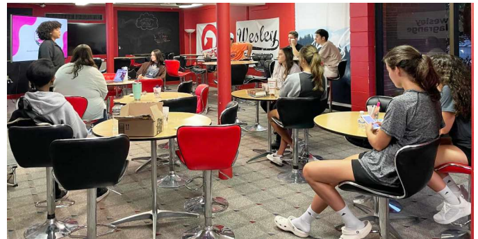
Below: Baptist Collegiate Ministry, Tuesday Night Bible Study