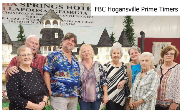
FBC Hogansville Prime Timers