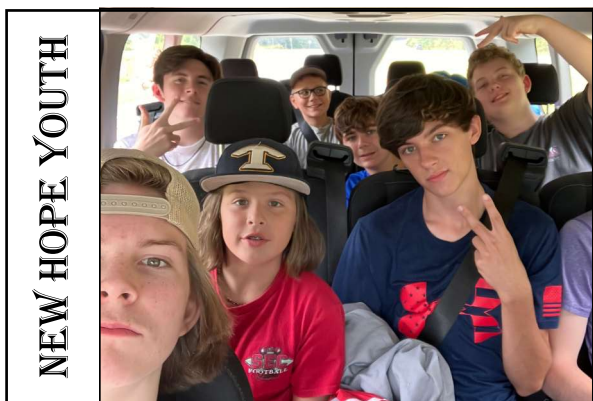
Above: New Hope LaGrange Youth enjoyed a trip to the North Georgia Mountains in September.