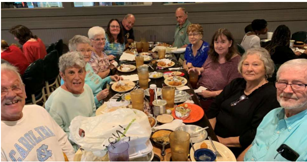
Grace: Sunday School Dinner in Anniston, AL

Highland - The special Bible Study, Lessons from Mayberry , continues thru October. There are many life lessons to learn from each episode and they've had a good crowd enjoying them each week. They meet in the church fellowship hall at 6:00 pm on Wednesdays. Everyone is welcome! Come and bring a friend!