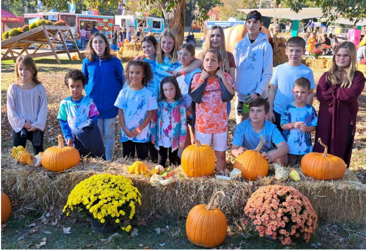
Roper Heights - Children and Youth enjoyed the Fall Festival at Callaway Gardens on October 9.

Roper Heights - The Little Lambs of Roper Heights went to Callaway Gardens and enjoyed all of the fall activities on Saturday, October 9. The kids have been very busy and so have the Son-shiners. They went to the Three Little Pigs in Pine Mountain. "Come to Roper Heights and see what's going on!"