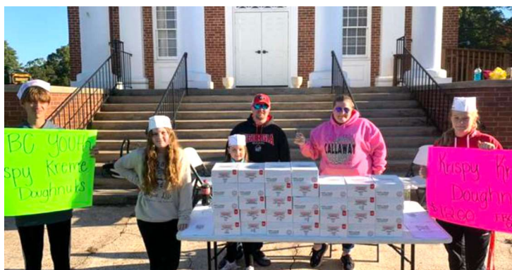
FBC Hogansville Youth sold Krispy Kreme Donuts during the Hummingbird Festival to fund their activities throughout the year.