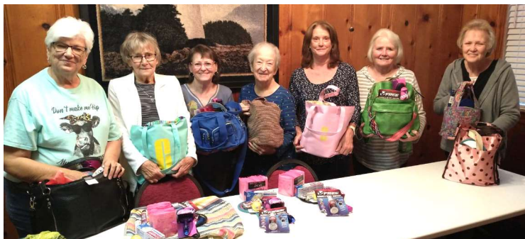
Above: Highland WMU collected totes & toiletries for the women of Harmony House.