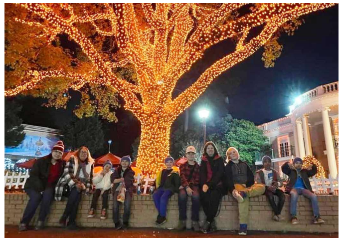
Dunson Youth enjoyed a trip to Six Flags.

• "Please join us in celebrating the birth of our Savior and spreading Christmas joy."