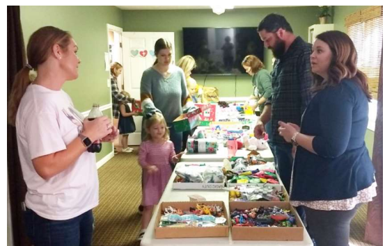
Above: MBC packing Operation Christmas Child boxes.