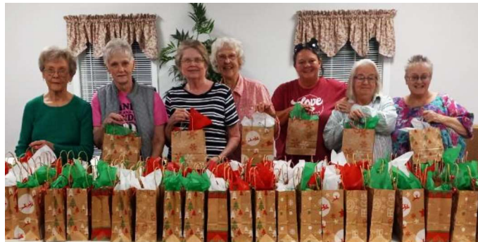
Roper Heights - Women on Mission group prepared gift bags for Twin Fountain Nursing Home residents.

• The Fall Festival was held on November 2. There were hot dogs and candy, candy, and more candy! Everyone had a great time.