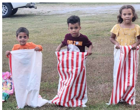
Roper Heights Children enjoyed their Fall Festival on November 2.

Shoal Creek - Sisters in Christ and Shoal Creek Baptist Church sponsored and decorated a Christmas tree as a part of the Tinsel Trail which is a fundraiser for Circles of Troup County. The Tinsel Trail, a free exhibit of live trees decorated by local businesses, nonprofits and churches, is on the square for the community to enjoy! The trees will be on display through January 1.