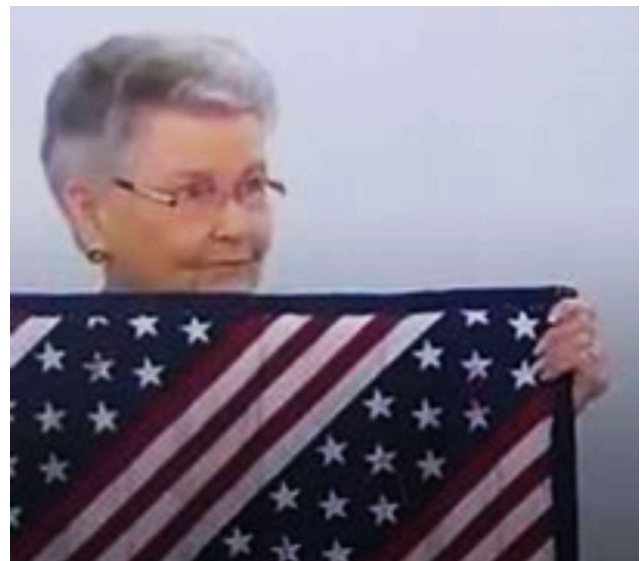
Ladies of Grace presented prayer quilts to two members.