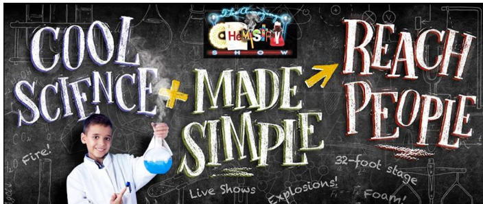
FBC: The Amazing Chemistry Show, March 3 @ 5:30 pm