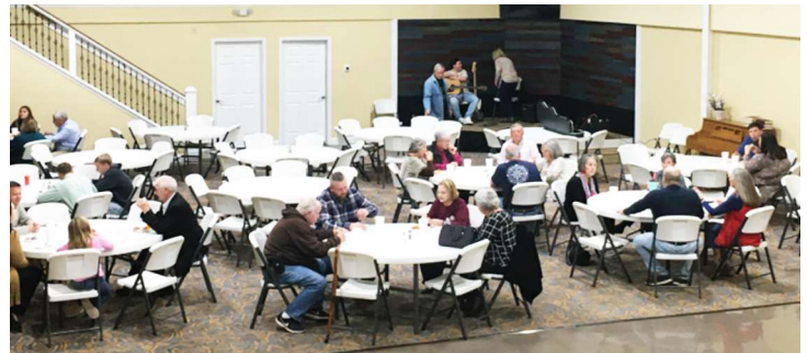
Above: Grace members enjoyed a Fifth Sunday Fellowship Meal following the evening service.