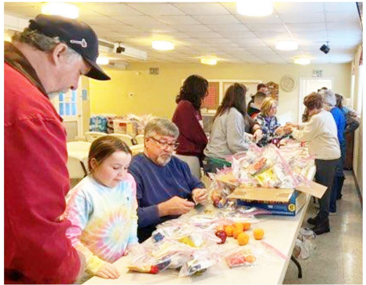
FBC Hogansville: Members packed 220 lunches for tornado victims and for volunteers working on-site.

• Coming Soon!! Celebrate Recovery is planning its 3rd Annual Car Show on April 29. Details will follow.