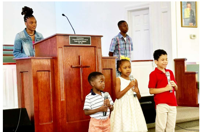
Above: All ages participated in the Youth Service at NMMBC.