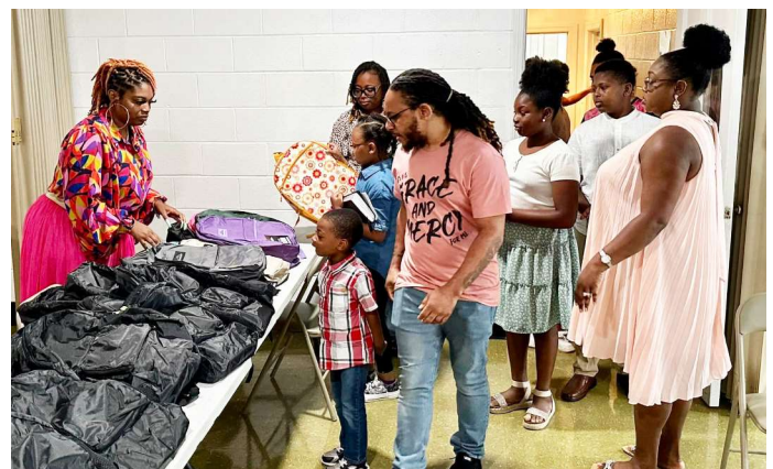
New Macedonia Missionary Baptist Church (NMMBC) gave out backpacks full of school supplies to students in the church and community!