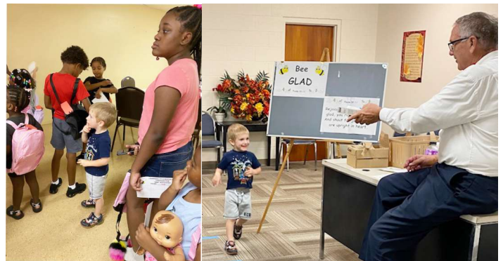
Dunson: Back-to-School Bash focused on the "Bee Attitudes"