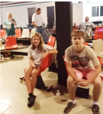
Above: Roper Heights at Valley Bowl on August 12