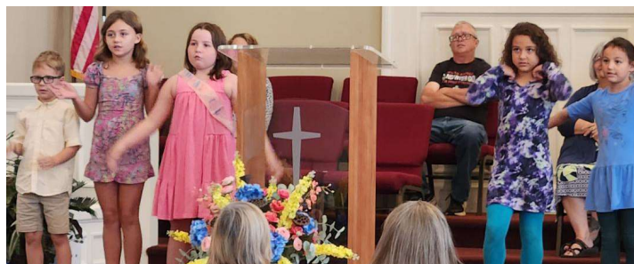
The Children of FBC Hogansville provided the Special Music on September 17.

Lost people matter to God, and they should matter to us. To sign up, please go to fbclagrange.org/evangelism .