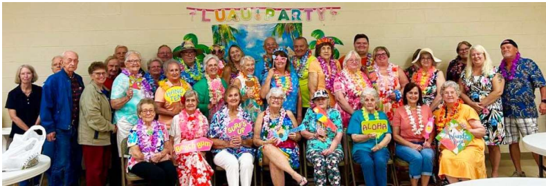
Baptist Tabernacle Lighthouse Keepers Summer Luau

Baptist Tabernacle (BTC) - The Food Ministry served 436 individuals, giving away 158 boxes of food with 175 meals being delivered. • The Awana Program has been off to a great start so far this year with many new leaders volunteering and new kids coming each week. • The Youth group had their party welcoming up the rising 6th graders with a night full of fun on September 13. There was an inflatable water slide set up as well as pizza provided for the youth, so it ended up being a night of great fellowship with many visitors participating. • The Sunday school contest for bringing visitors is still going on until the end of September. There have been many new visitors coming to a variety of Sunday school classes so far this month! • The Lighthouse Keepers met on Monday, September 18 to finish out the summer with a luau. The fellowship and fun were wonderful! • The annual Trunk-r-Treat fall festival will be on Halloween day. Baptist Tabernacle is excited about serving the kids in our community this year and giving them a safe place to come and get their candy and more importantly a place to hear about the Lord.