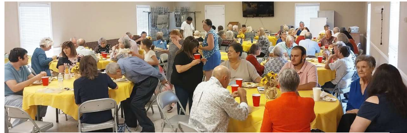
Above: Highland celebrated Homecoming on September 10.

• The WMU collected Purses for Harmony House in September. Each donated purse was filled with personal items such as a hairbrush, comb, lotion, crackers, Chapstick, shampoo, etc. They are also accepting donations of individually wrapped candy to be given out during Trunk N Treat. • Trunk N Treat will be held on Tuesday, October 31, from 6:00 until 7:00 pm. at the church. Everyone looks forward to seeing the excited children and giving them candy and Bible tracts from decorated trunks of cars lining our parking lot. All children are welcome!