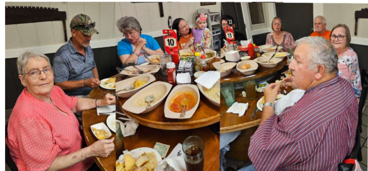
Creekside members enjoyed a meal together at Buckners Restaurant on September 9.