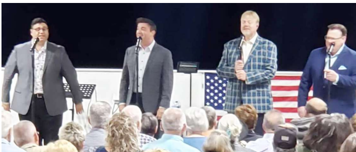
Creekside Above: There was a large group in attendance for the gospel singing featuring the Gold City Quartet (above) and Kingdom Express (not pictured).