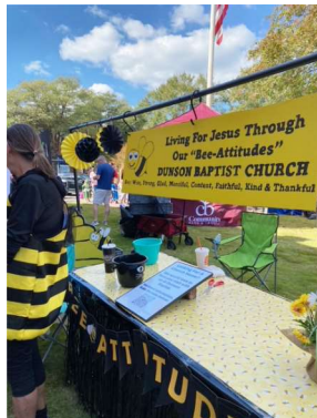
Above: Dunson participated in the Walk for Jesus by setting up their Living for Jesus "Bee Attitudes" booth.