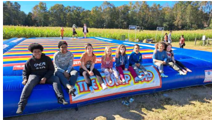
Above: Roper Heights Kids enjoyed a trip to the Punkin Patch