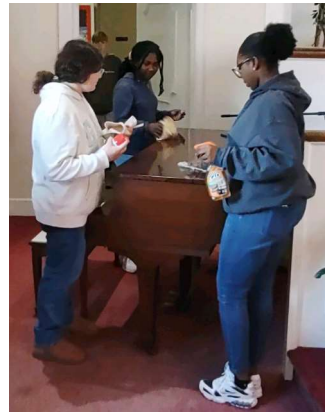
Lafayette Christian School Work Day at Second Baptist Church