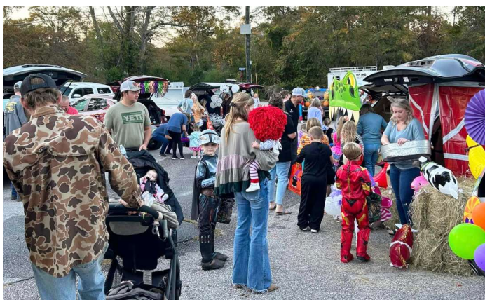
Mountville Trunk or Treat on October 25

Lakeview - Breakfast is served every Sunday at 9:15 am in the fellowship hall.