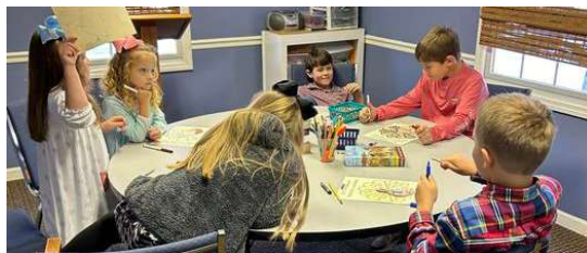
Mountville Team Kids