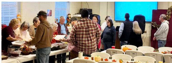
Above: FBC Hogansville's Community Thanksgiving Meal