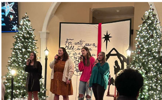
At Left: Mountville Hanging of the Greens, November 26