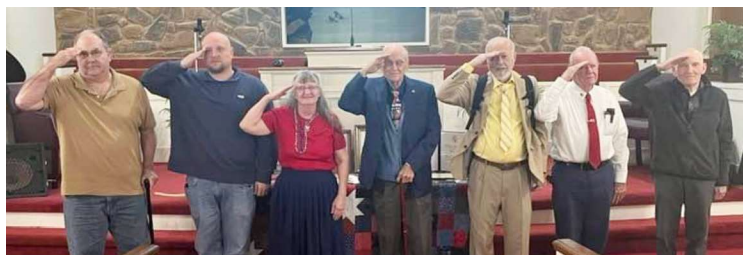
Above: Dunson recognized their veterans in a special service.