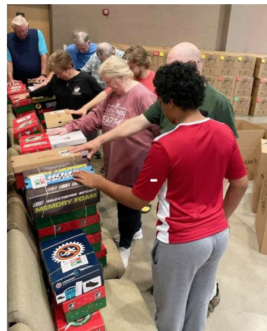
Above Right: Second Baptist Church prepared and donated 67 Operation Christmas Child Boxes.