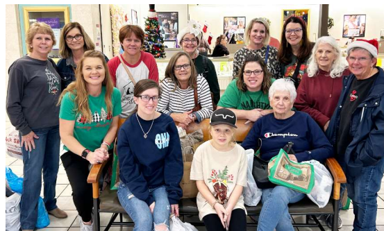
Above L: MBC provided Christmas gifts for families & foster children. Above R: Mpcat Christmas Party

Above: Ladies of Mountville enjoyed a Christmas outing to Auburn Mall and Buc-ees