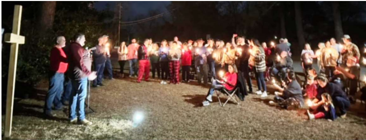
Above: Reeds Chapel Christmas Eve Community Candlelight Service

Roper Heights - On December 4, Roper Heights WOM and Brotherhood had their Christmas party at Milano's in Valley. A great time was had by all.