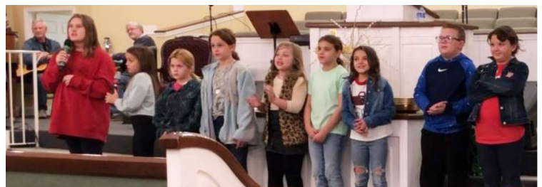
Grace: Children sang Christmas Carols for the Wednesday night service on December 13.