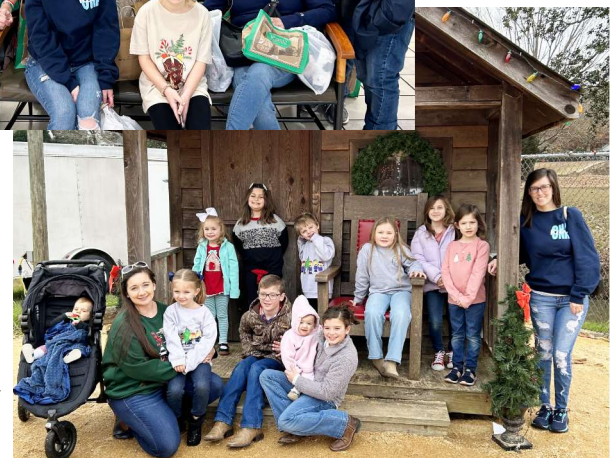
Mountville Kids visited the Christmas Carousel in Valley, AL