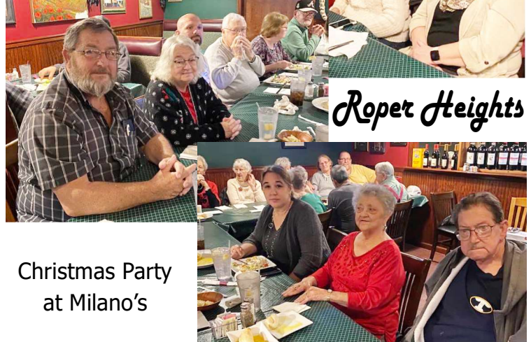
Christmas Party at Milano's