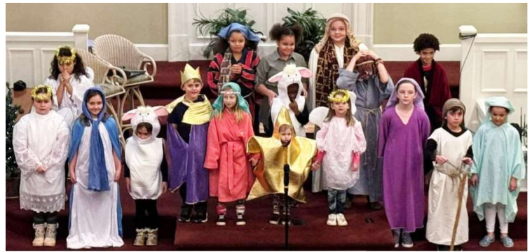
FBC Hogansville: Children's presentation of the Christmas Nativity.

• First Baptist Hogansville looks forward to the coming year with enthusiasm and wishes everyone a Happy New Year!