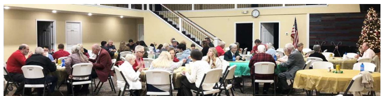
Grace: Members enjoyed a Christmas Meal together on December 17.