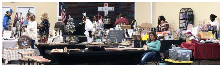
Grace: Craft Fair to benefit Children at Christmas