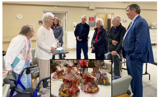
Above: Dunson members delivered goodies prepared by WMU.