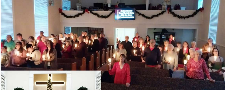
Highland's Candlelight Communion Service was held on Christmas Eve. There was a great turnout and it was a beautiful service. (above)

Highland - The annual Hanging of the Green was presented on Sunday, December 3. The Sanctuary was beautifully decorated with Christmas wreaths, bells, poinsettias, etc., as everyone sang carols and welcomed the Christmas season. • The choir gave an outstanding presentation of The King Is Born on Sunday, December 17, followed by a church-wide luncheon.