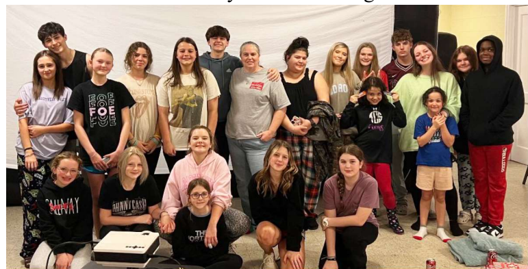
Above: FBCH Youth watched "Overcomer" at their Movie Night.